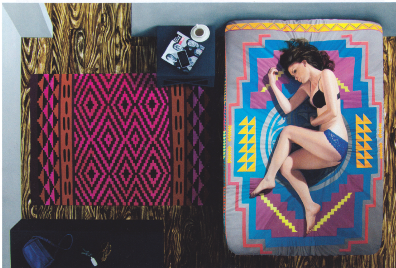
SOUTHWESTERN MEDALLION AND DIAMOND RUG, OIL ON PANEL, 24 X 36"